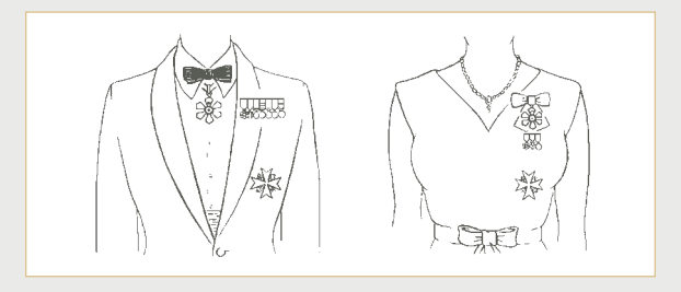
WOMEN • LONG or SHORT DRESS

NOTE: Miniature badges may also be worn with business suit at a formal evening event.