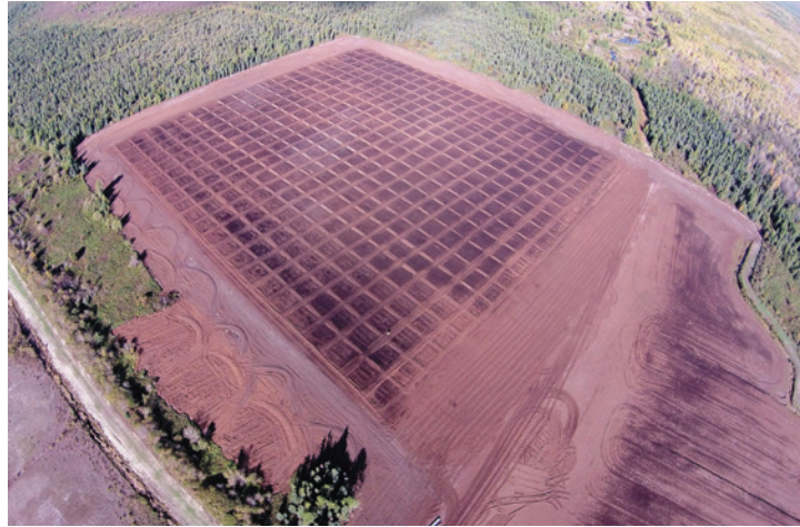
Figure 3. Checkerboard-pattern dikes in Elma, Manitoba.

The bulldozer operator pushed the excess peat over a 10-metre distance with the blade, then built a dike with the gathered material. The operator then compacted the dike with the bulldozer's tracks, before building a new dike parallel to the first, 10 metres farther away. Upon reaching the end of the site, the operator started the process anew, building dikes perpendicular to the ones just created, taking care to lift the blade at each dike encountered. Finally, a tractor was used to compact the perpendicular dikes without damaging the first ones.