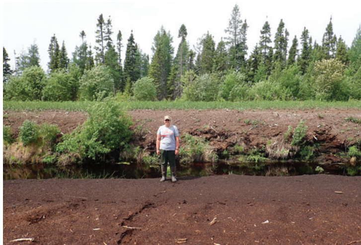
Figure 5. Significant difference in elevation between the restored sector and the adjacent environment at Moss Spur 2 in Manitoba.

Building and maintaining the drainage network around the peatland also changes the surrounding environment when the excavated material (organic and mineral matter from the bottom of the ditches) is placed at the edge of the adjacent environment. In some places, they form large terraces of compacted substrate that are used to allow machinery to move around the peatland. Similarly, mounds of debris, such as branches and roots from harrowing and cleaning the fields in operation, can also create embankments around the peatland. These can form the ideal environment for undesirable species (often ruderal or invasive) and, inversely, create a barrier keeping diaspores of typical peatland species from reaching the site to be restored.