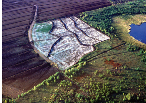
Figure 2. Aerial photo of the Inkerman Ferry restoration site in New Brunswick. The dikes were erected along contour lines obtained from a topographic survey.