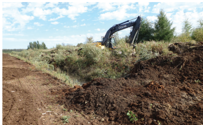
Figure 6. Removing the embankment and filling the ditch at Elma in Manitoba.

Restructuring the slope therefore makes it possible to extend the restored area all the way to the edge of the adjacent environment rather than being limited strictly to the surface occupied by the extraction fields.