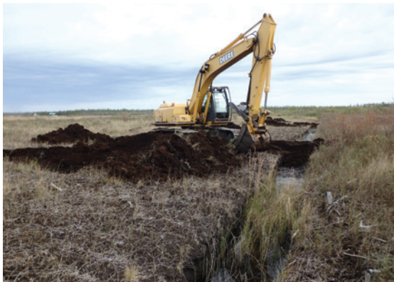
Figure 8. Blocking a secondary drainage ditch with peat, at the South Julius peatland in Manitoba.

For all sites, it is best to begin working in the higher sections, because blocking the dams in upper areas will create better (dry) working conditions when putting in the lower dams.