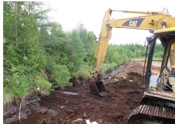
Figure 9. Blocking a peripheral drainage ditch using a wooden dam covered with geotextile on the upstream side and peat, at the Bic-Saint-Fabien peatland in Québec.