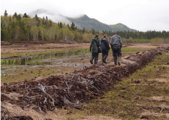
Figure 1. Dike perpendicular to the slope at the Saint-Fabien-sur-Mer peatland in Québec, two years after restoration.

the same elevation. The dikes at the Inkerman Ferry site in New Brunswick were positioned in this way, which helped ensure better water distribution than if they had been built without taking the slope's complexity into account (Figure 2). Given their effectiveness and ease of construction, dikes perpendicular to the slope should be erected on nearly all peatland restoration sites.