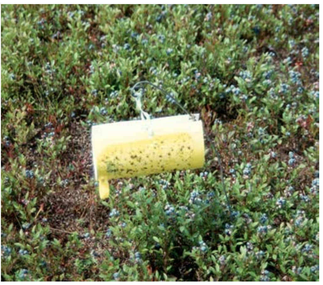
Fig. 4. Blueberry fruit fly trap

also be placed in areas known to be infested in previous years. Traps should be set up in the last week of June in southern New Brunswick and in the first week of July in the northern part. Traps should be inspected three times a week. The first spray should be applied within 5 days of the first adult capture. The traps should continue to be inspected to determine whether or not а second spray İS required. А second spray will be required if there is an average of one fly caught per trap per day. Flies should be removed from traps when inspected to