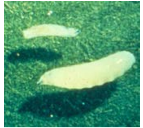
Fig. 1. Blueberry fruit fly larvae

Cultural. The following cultural practices aid in controlling the blueberry fruit fly: pruning, sanitation, weed control. Pruning fields reduces pest levels as there is no crop available for emerging flies to deposit their eggs. This forces the blueberry