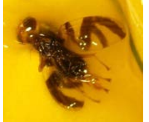
Fig. 2. Adult blueberry fruit fly on trap