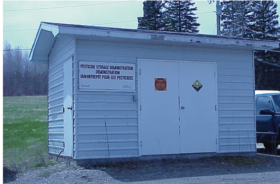
Example of pesticide storage building

Please note: The regulations or guidelines in your province must be consulted for minimum separation distance requirements.