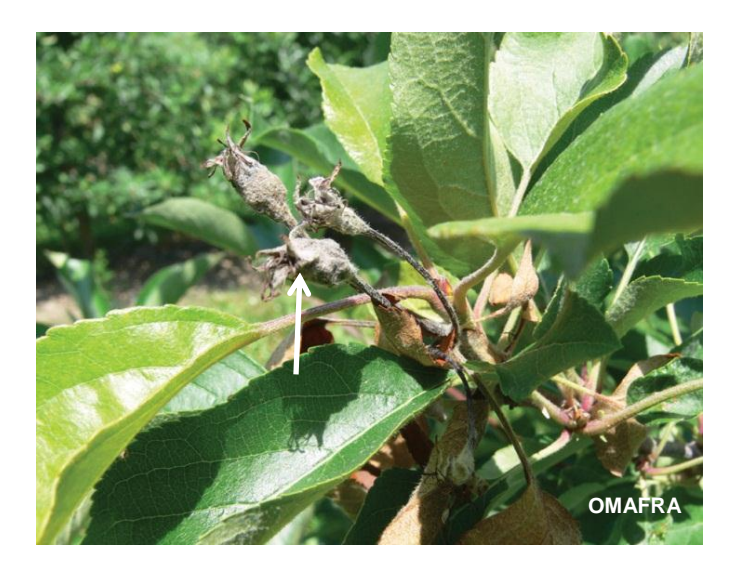
Fig. 1: Blossom blight symptoms

Fire blight attacks different plant parts and the disease has various names depending on the part of the tree infected. For example, blossom blight (Fig. 1) refers to fire blight infection of flower blossoms. Blossom blight is the first symptom to appear shortly after bloom. Initially, there is a water soaked appearance to the blossoms, followed by wilted (shriveled) blossom clusters and finally, discolouration of the blossoms progressing from dark green to brown or black. Shoot blight (Fig. 2) first appears one to several weeks after petal fall. Disease symptoms continue to advance throughout the spring and summer season on susceptible tissue (leaves and branches).