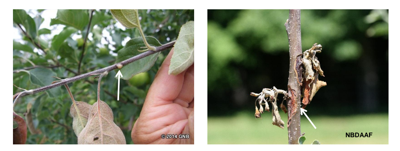
Fig. 3: Shoot blight symptoms (note bacterial ooze) Fig. 4: Canker on infected branch

Usually the most succulent shoot tip and suckers become infected first and wilt from the tip downward.