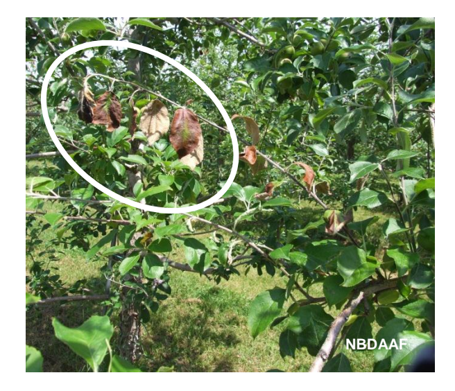
Fig. 2: Shoot blight symptoms

The young, succulent tissues turn brown or black and the shoot tips curl in a characteristic way referred to as 'shepherd's crook'. Under warm and humid conditions the fire blight bacteria multiplies rapidly and small droplets of milky coloured, sticky bacterial ooze start to appear on the surface of blighted shoots (Fig. 3). The bacterial ooze turns brown soon after exposure to the air.