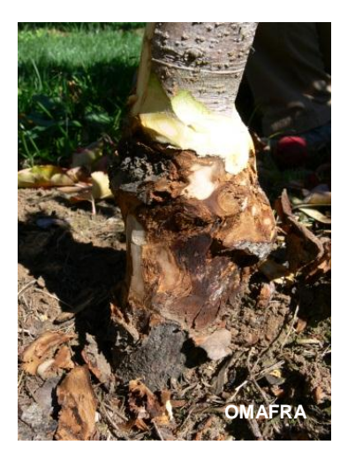
Fig. 6: Root stock blight symptoms