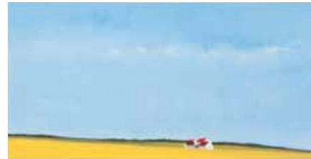
Hendrik Gringhuis, Yellow Field / Champs jaune, 2010

The artist finds inspiration in his homeland (Holland) with its huge skies and flat countryside. He also looks at the relationship between buildings and the land, and the work of some American landscape artists. Idea: Contrast urban and natural environments in art.