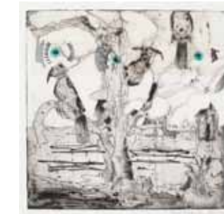
Yvon Gallant, Ice Cream / Crème glacé, 2008

Using the printing process of monoprint , the artist explores nature in distress and plant and biological matter in an altered state. Idea: Create an artwork depicting environmental degradation.