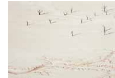
Freeman Patterson, On the Shore of the Lake That Was #1 / Sur la berge d'un ancien lac (image n° 1), 2010

The artist calls these images "ghosts of his travels", reflecting passing moments similar to the "click" of the camera - a very tiny fraction of taking a longer look at something as it passes us. The camera cannot negotiate this, so it blurs the image. Idea: Think about Ansel Adams' quote: "There are always two people in every picture: the photographer and the viewer."