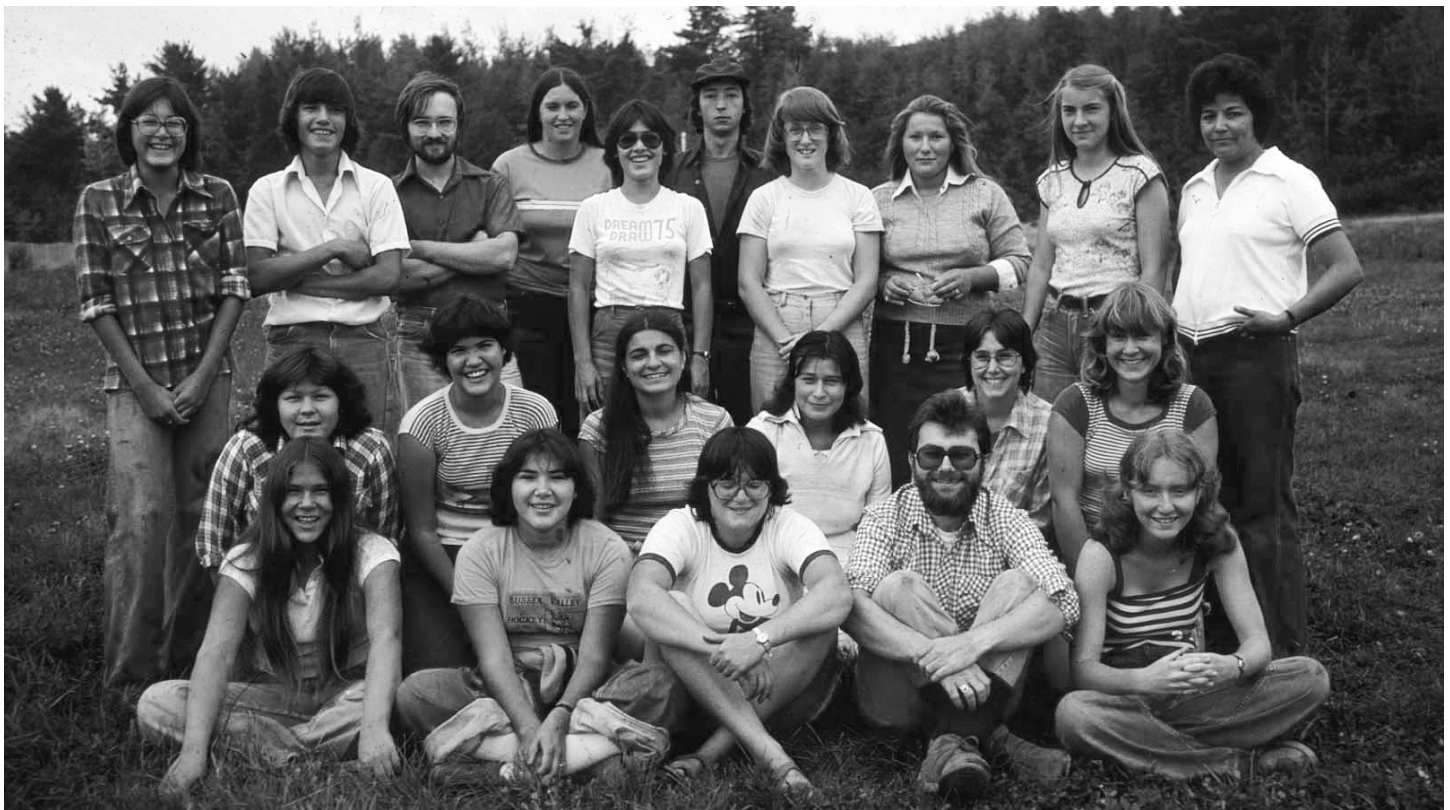
Metepenagiag archaeology and exhibit team (1979).