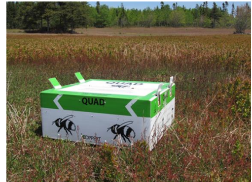
Fig. 5. Example of a commercial bumble bee quad (four colonies per box).