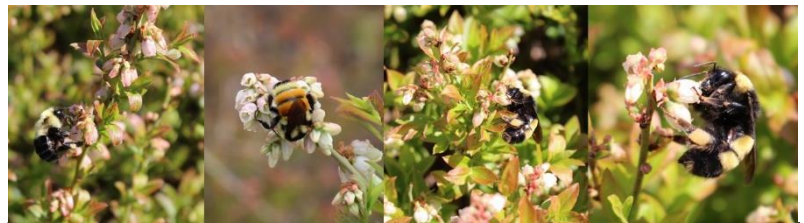
Fig. 3. Queen bumble bees foraging on wild blueberry flowers in New Brunswick, 2018.

Life cycle. Bumble bees (Figure 3) have an annual colony cycle that begins early in the spring when overwintered queens emerge from their hibernation sites in the soil to feed on spring flowers and search for a suitable location (often a former rodent nest) for the new colony. Once the site has been found, the queen collects pollen, forming it into a lump upon which she lays her first brood of 7 or so worker eggs. The eggs hatch soon after, and begin feeding on the pollen lump, and on additional pollen and nectar collected by the queen. Adults emerge from a short pupation about 21 days after the eggs are laid. This first group takes over pollen and nectar collection while the queen continues to lay successive waves (broods) of worker eggs. By mid-summer, a colony contains between 20 and 300 workers, depending on the species. It is around this time that the colony begins to produce males and queens. The new queens leave the nest, and after mating