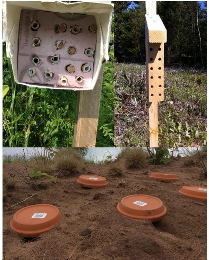
Fig. 8. Examples of trap nests for mason bees: milk carton top left, wooden top right, overturned clay lids bottom.