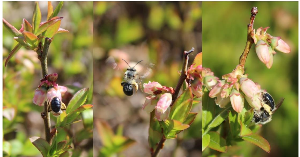
Fig. 6. Various Andrena bees foraging on wild blueberry flowers in New Brunswick, 2018. Note the telltale black, teardrop-shaped abdomen.