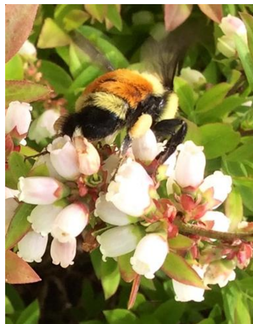
Fig. 1. A bumble bee visits wild blueberry flowers- note the enormous pollen loads on her back legs.

Native bees often have adaptations to make them effective and efficient at foraging, and thus pollinating, wild blueberries. Bumble bees (Figure 1), for example, have large bodies to move pollen from flower to flower, and are well-adapted to cooler temperatures associated with the early pollination season of wild blueberries. Bumble bees are also able to buzz pollinate or perform 'sonication'- this involves shaking the flowers, which is an advantage to release pollen in blueberry's poricidal anthers.