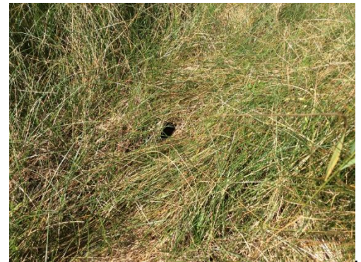
Fig. 4. A bumble bee nest entrance in an old hay field.

Common solitary native bees in wild blueberry pollination include the andrenid bee ( Andrena species). Males emerge slightly before the females in the spring. Once both sexes emerge and mate, the female forages for pollen and locates a nest to lay and provide for her offspring. Lifespans of these solitary bees rarely exceed 4-6 weeks. Ground nesting bees including andrenids will seek out sandy, warm soil while many mason bee species will seek out plant stems or sticks to lay their eggs. Solitary bee females typically live alone in a nest of her own construction